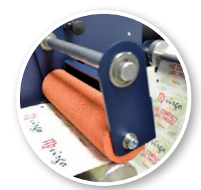
Sponge pressing roll