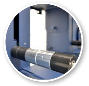
Ultrasonic tension arm