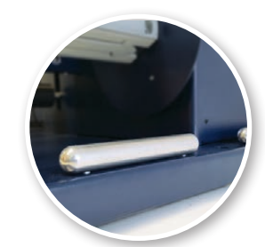
Handles (two for each side)