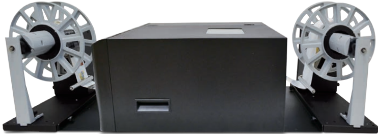
LABEL REWINDER - Primera LX2000 Printer - LABEL UNWINDER (Not included)

The unwinder and rewinder for Primera LX series printers make it easy to unwind and rewind large quantities of labels.