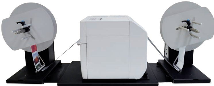
LABEL REWINDER (ASD1111-S0) - Epson TM-C3500 printer - LABEL UNWINDER (ASS1111-S0) (Not included)

The new Unwinding/Rewinding system for Epson TM-C3500 Label Printer can handle media up to 127mm (5") wide and unwind/rewind label rolls having outside diameter up to 250mm (9.84"). Units are equipped with a 3" or adjustable core holder from 40 to 118mm (1.57" - 4.64").