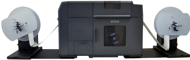
LABEL REWINDER (ASD1111-S0) - Epson C7500 printer - LABEL UNWINDER (ASS1111-S0) (Not included)

The Unwinding/Rewinding system for Epson C7500 Label Printer can handle media up to 127mm (5") wide and unwind/rewind label rolls having outside diameter up to 250mm (9.84").