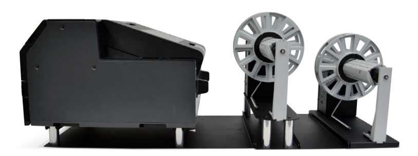
Epson C6500P printer - LABEL UNWINDER (UW6500P) - LABEL REWINDER (RW6500P) (Not included)

The Roll to Roll system specifically designed for Epson C6000P/C6500P color label printer can handle rolls up to 220mm (8.66") media wide and having an outside diameter up to 250mm (10"). Both Unwinder and Rewinder are equipped with a fixed 3" core holder.